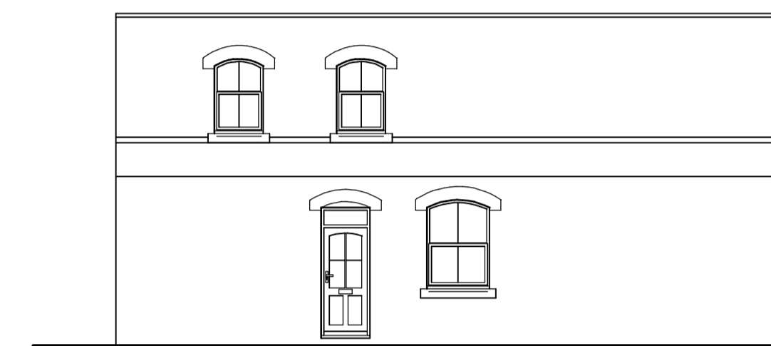
End Elevation to access