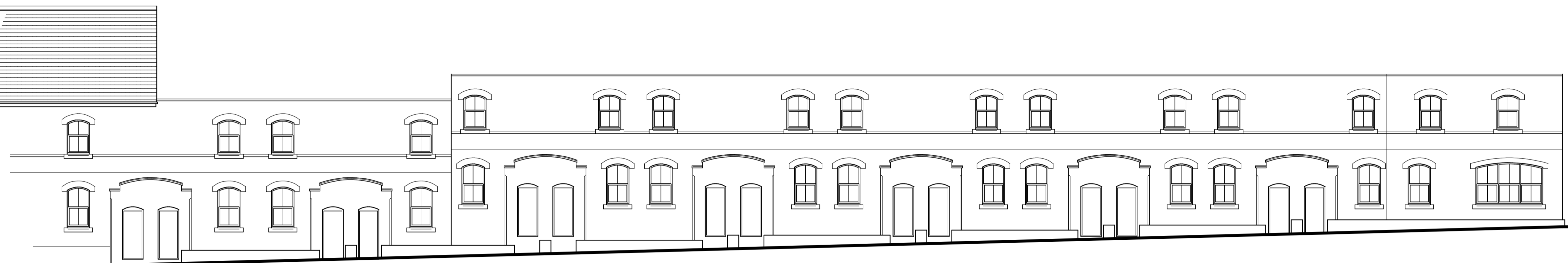
Elevation To Attleborough Rd